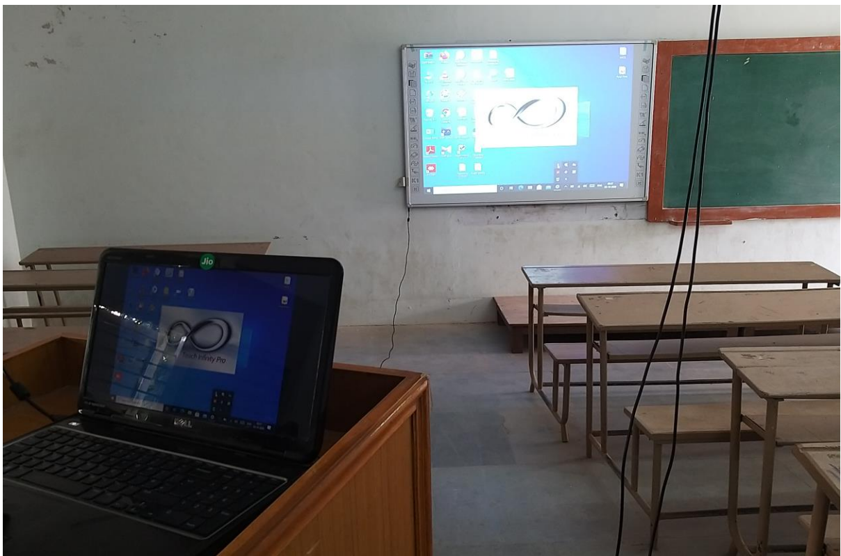
SMART INTERACTIVE BOARD-ROOM NO. 25